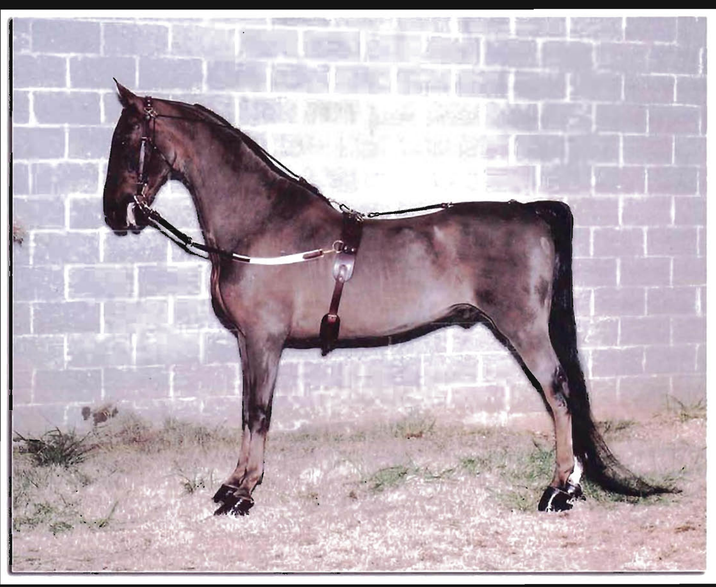
A bitting rig, designed to teach a horse's muscles the desired head carriage.