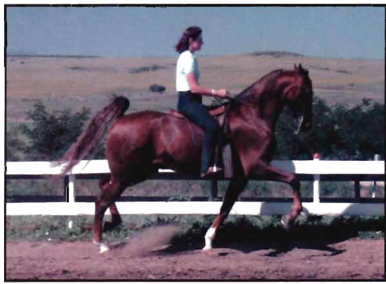
The high headset of this horse is intended to enhance the action of the front legs.

In a gaited horse, a modification of this position, creating semi-collection, can be the difference between a horse that does a hard pace, or one that works in a more desirable easy gait. But, this particular head and neck