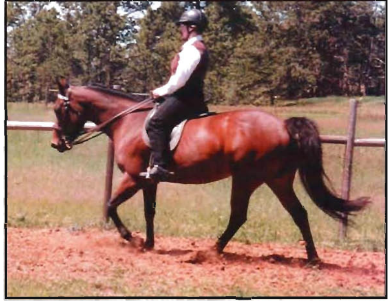
This horse works best in her gait with what most would consider a relatively low head and neck position. With a higher head she tends to fall out of her running walk into some other intermediate gait.

improving his "showy" look with high knee action by changing the dynamic of his back and shoulder as he moves. The environment of the show ring exaggerated these features of head and neck position, until the most extreme examples of both became valued, and in the process, the biomechanical advantage originally conferred by