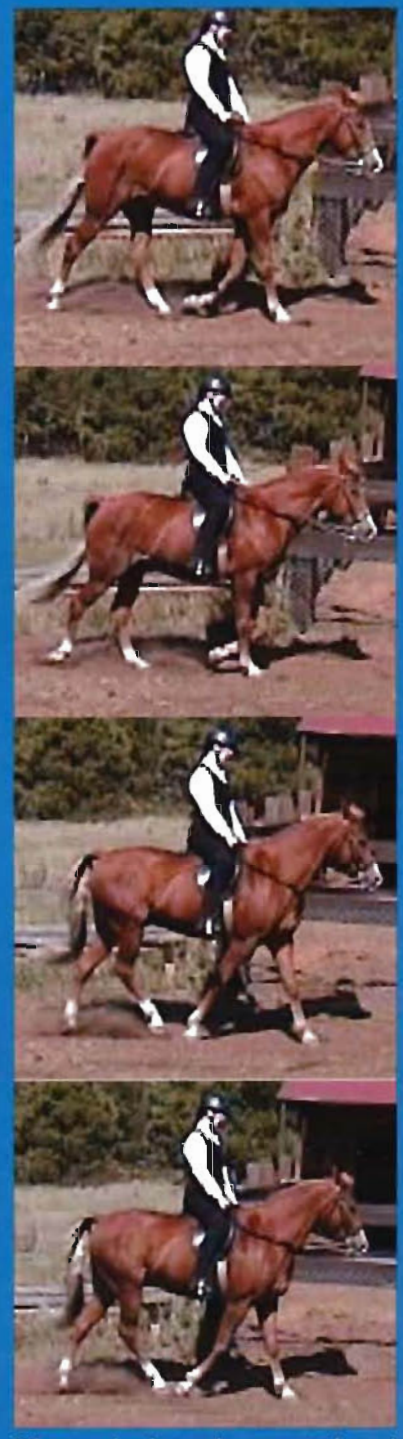
The two-leg lateral support phase is very short in this gait, while the diagonal two leg phase lasts a bit longer.