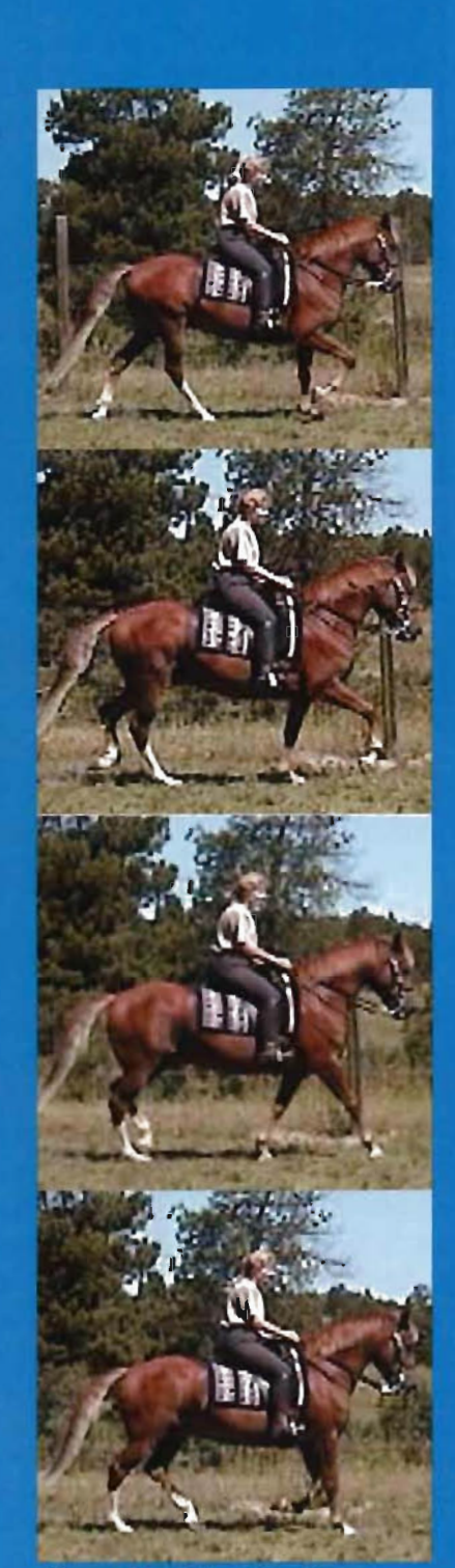
Pictured is a Paso Fino horse doing the trocha, or foxtrot, gait.

Weight shift: There are three ways a horse can shift his weight between hooves. A walking weight shift is what happens when weight is transferred as both hooves are flat on the ground.