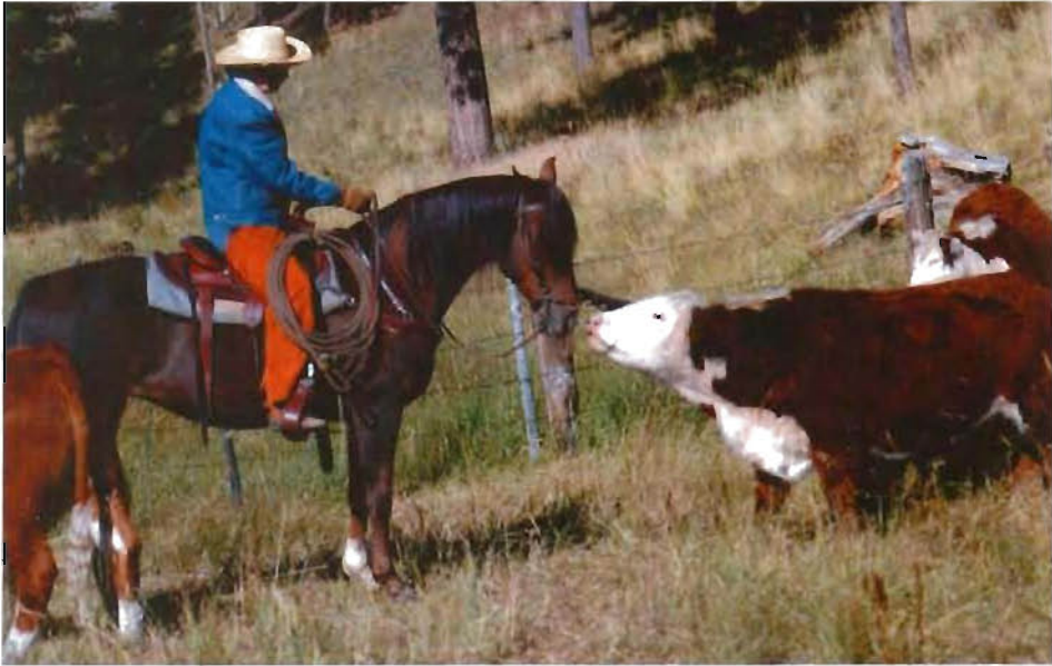
Some fox trotters love cattle. Missouri Fox Trotter, Metronome, with some of her buddies on a crisp fall day.

In the fox trot, at slow and moderate speeds, there is either a walking or a running transfer of weight between the front hooves, and a walking transfer between the hind hooves. With more speed, there may be a running transfer between the hind hooves as well. Very rarely is there a leaped transfer of weight between either the front, or the hind hooves. There will always be at least two hooves firmly planted on the ground at any phase of the gait. This is what gives the gait its smooth ride, and sets it apart from the true trot, in which there is a moment of suspension where all four hooves are clear of the ground. (bounce, bounce!)